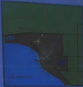
Inset identified in this region of the Lac qui Parle River and the regions being of water control for the watershed, with 1, 2012, & areas located to South Dakota and NE & states in Minnesota.