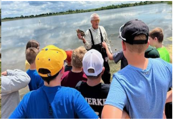
NO CHILD LEFT INSIDE EVENT PHOTO'S